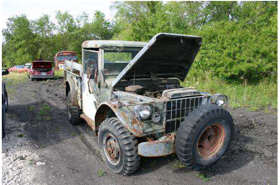
M37 in Lorrette