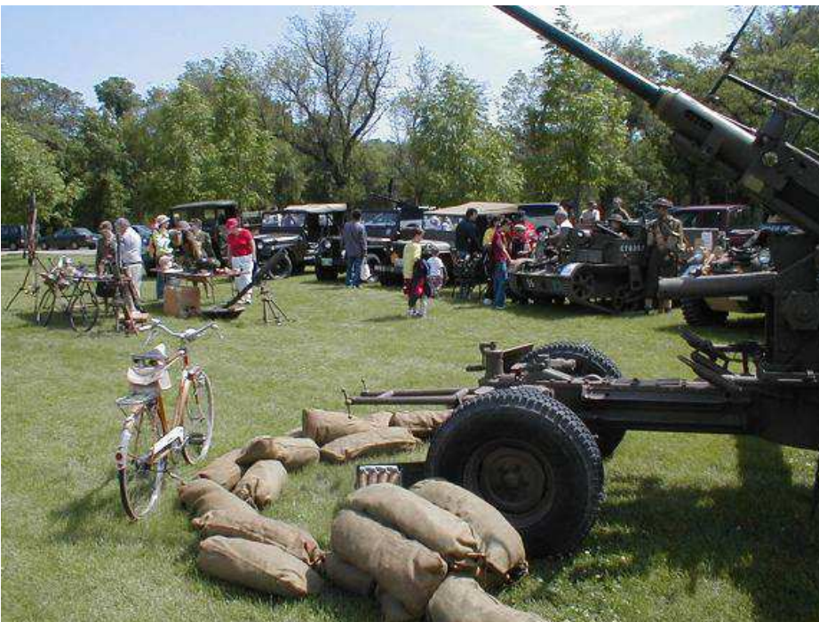
Canada Day at Assiniboine Park