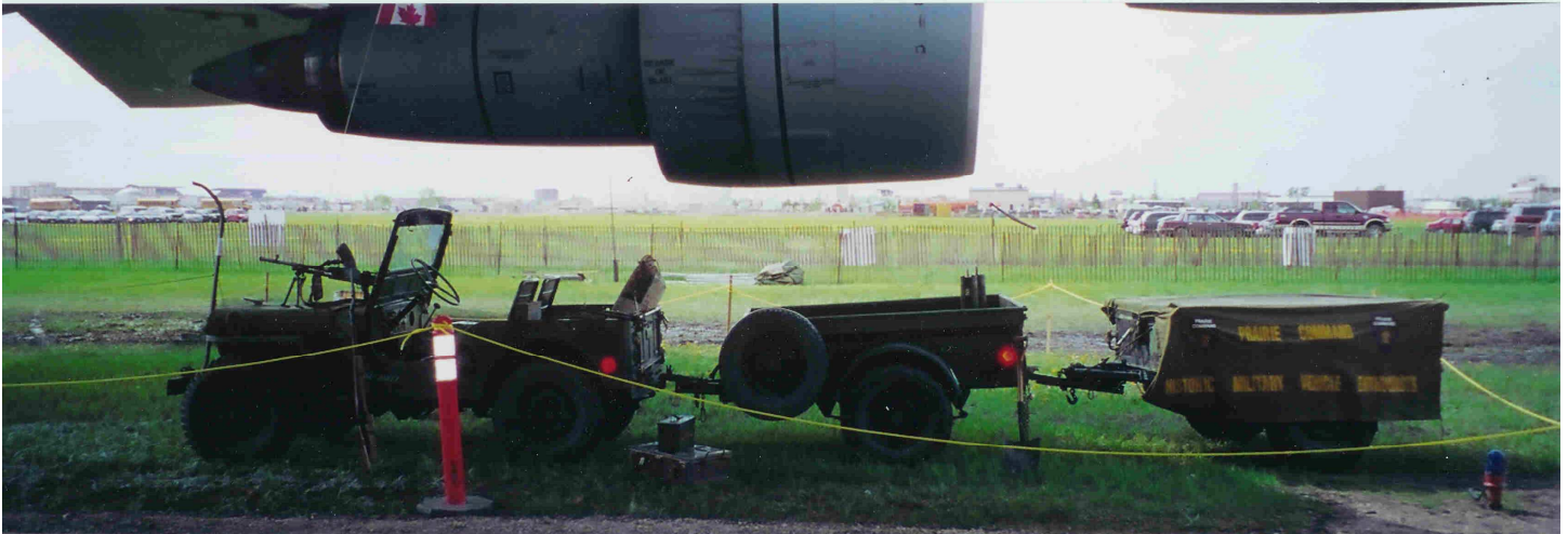
Al's Trailer Train